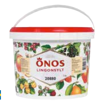
Onos Lingonsylt Lingonberry jam 5kg tub 13101012