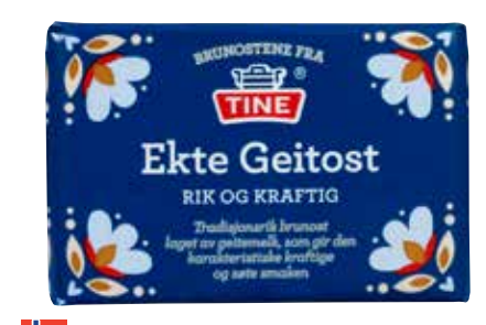
Tine Ekte Geitost