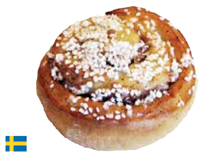
Frozen Bake Off Cinnamon Buns * Ready-made cinnamon buns 1 x 55 7396