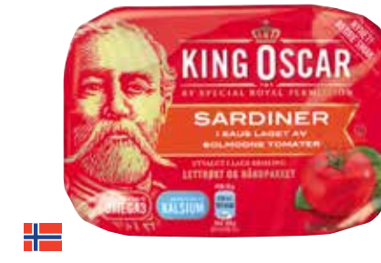
King Oscar Sardiner I Tomatsaus Sardines in tomato sauce 12 x 106g 1705

Sardines in extra virgin olive oil 12 x 106g 1706