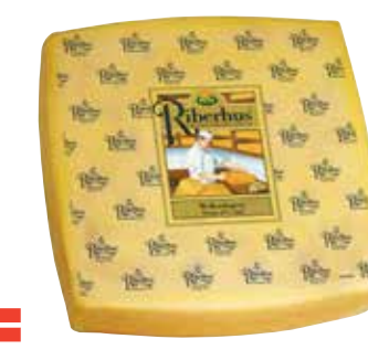
Arla Danbo Riberhus 45+ Riberhus cheese, mature c.8kg block 9643