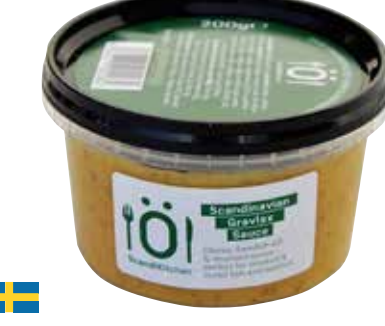
ScandiKitchen Dill & Mustard Seafood Sauce 8 x 200g 111092