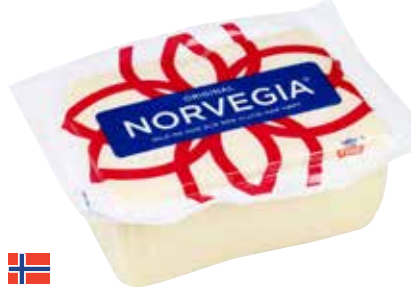
Tine Norvegia Mild cheese c.5kg block