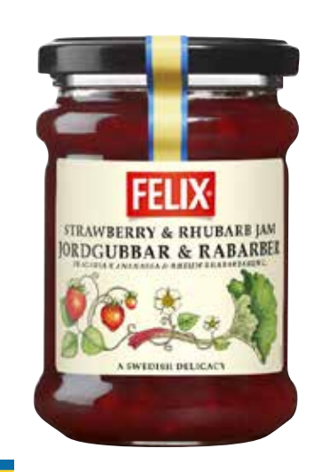
Felix Strawberry & Rhubarb Jam 8 x 283q 1402917