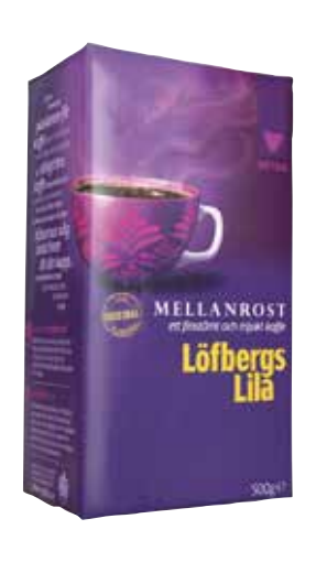
Löfbergs Lila Mellanrost Medium roast ground coffee