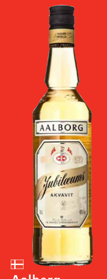
Aalborg Jubileum 42% Aquavit

Svenska Nubbar 36.2% Mini Aquavit Selection 10 x 50ml 5648