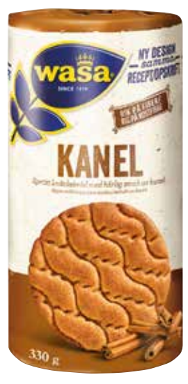
Wasa Kanel Wheat crispbread with cinnamon flavour 12 x 330g 8545

Leksands is known for their high quality and this Sourdough Crispbread is well worth a try. Slightly crisper and thinner than many other crispbreads it has a wonderful rustic, homemade flavour. Works especially well with cheese or smoked salmon. A great centrepiece for any occasion.