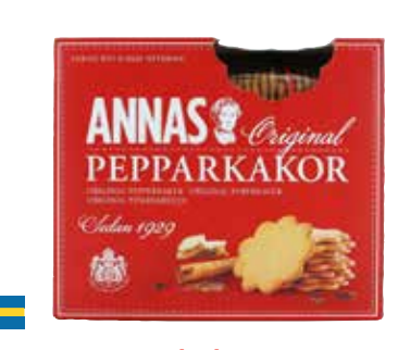
Annas Pepparkakor Classic Swedish ginger snaps 24 x 300g 7326 400g 111262