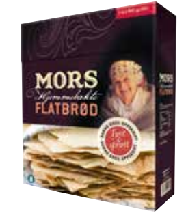
Stabburet Mors Flatbrød Thin rye flatbread 12 x 520g 2422

Wheat crispbread with sesame seeds and sea salt 12 x 290q 8544