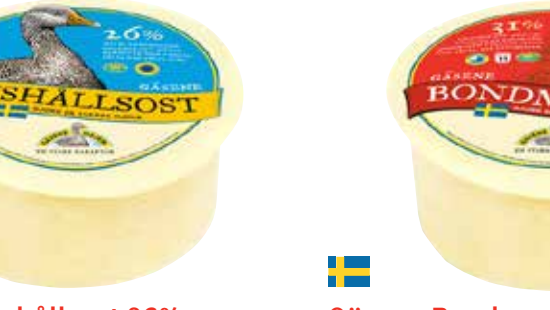
Gäsene Bondmoran 31% Mature (12 Month) hard cheese 500g 9570