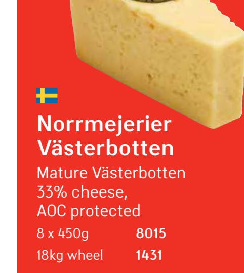
Västerbotten cheese is a cheese from the Västerbotten region of Sweden. Mature and fullflavoured; similar to Parmesan or Pecorino in texture.