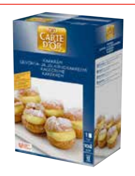
Carte d'or Kagecreme Crème de patisserie, ready mix 800g 9781