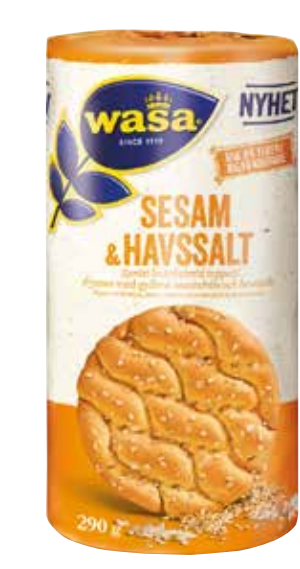
Wasa Sesam & Havssalt

Wheat crispbread with sesame seeds and sea salt 12 x 290q 8544