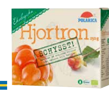
Polarica Hjortron Frozen cloudberries