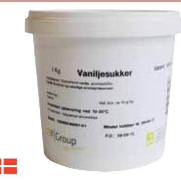
Fusgaard Vaniljesukker Vanilla sugar 1kg 6360