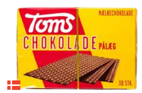
Toms Pålægschokolade Lys Milk chocolate thins for sandwiches 24 x 120g 7192