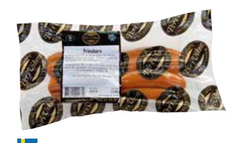
Per i Viken Prinskorv

Lightly smoked cocktail sausages 6 x 500g 9891