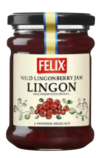
Felix Wild Lingonberry Jam 8 x 283g 1402919