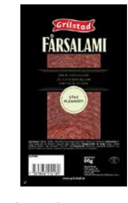
Grilstad Farsalami Lamb salami, sliced 5 x 80g 7741