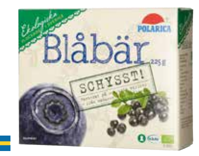
Polarica Blåbär Frozen bilberries