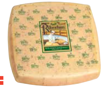
Arla Danbo Riberhus Kommen Riberhus cheese with caraway seeds, mature