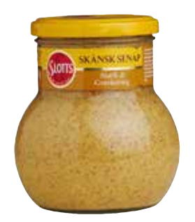
Slotts Senap Skansk Course Mustard 12 x 250g 8443