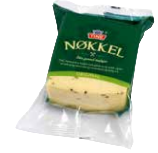
Tine Nøkkel Ost Mild cheese flavoured with cloves and cumin seeds c.5kg block 2488