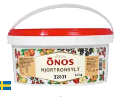
Onos Hjortronsylt Cloudberry jam 2.2kg tub 140530