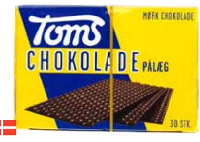
Toms Pålægschokolade Mørk Dark chocolate thins for sandwiches 24 x 120g 7193