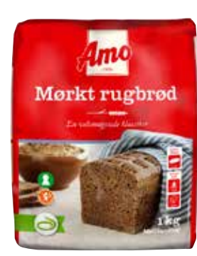
Amo Mørkt Rugbrød Mix Dark rye bread mix 10 x 1kg 5910