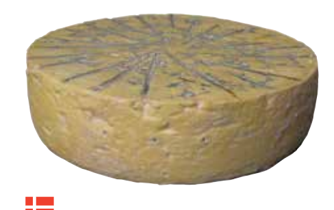
Kornblomst Økologisk Ost Organic blue cheese c.3kg block 1405011