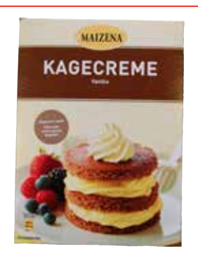
Maizena Kagecreme Vanille Crème de patisserie mix 10 x 180q 6583