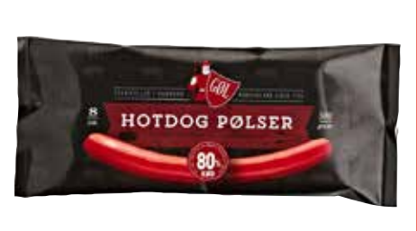
Gøl Rød Pølse Danish red hotdogs, lightly smoked 10 x 375q 9314

Johan i Hallen Renkorv Reindeer sausage 300g 290101