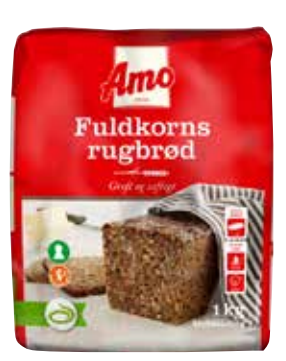
Amo Fuldkorns Rugbrød Mix Multigrain rye bread mix 10 x 1kg 5907

Fresh yeast is essential to any Scandinavian baking recipes. Scandinavians usually bake with fresh yeast.