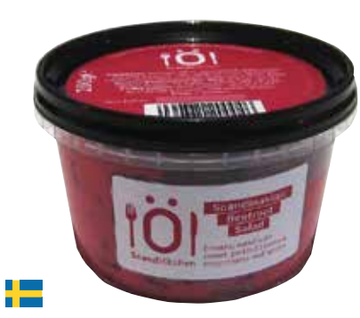
ScandiKitchen Beetroot Salad