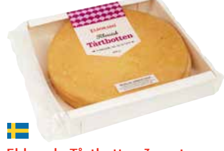
Eldorado Tårtbotten 3-part Sponge cake layers 10 x 330g 7747