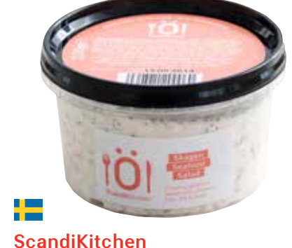
Skagen Seafood Salad 8 x 200g 111011