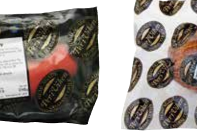
Per i Viken Rokt Bog Smoked shoulder of pork 9888 c.1kg